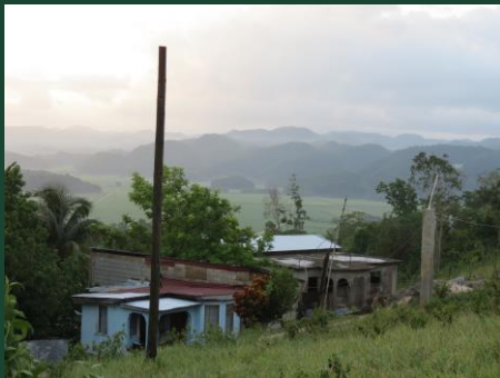
View from St. Gabriel Church Balaclava, Jamaica